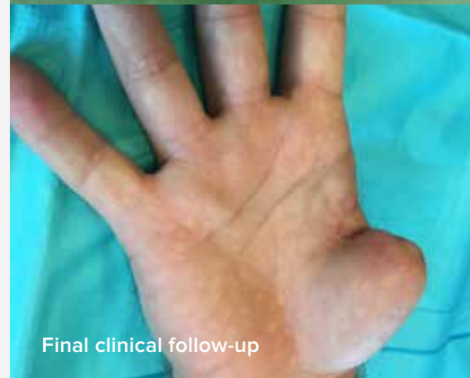
Final clinical follow-up