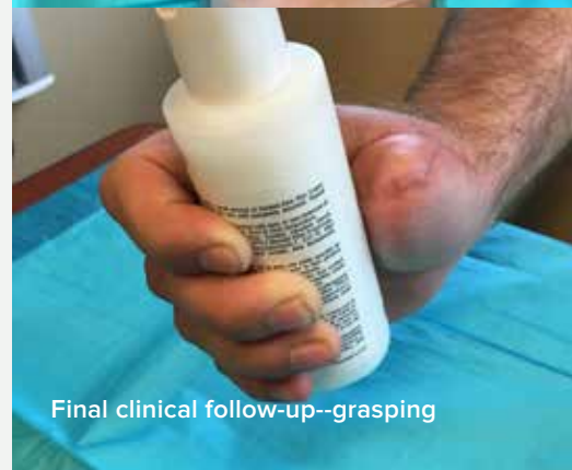
Final clinical follow-up--grasping