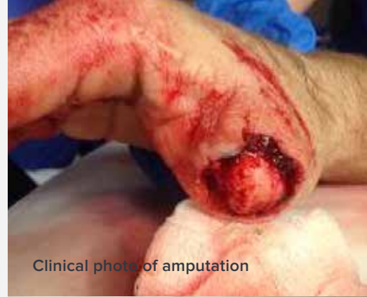
Clinical photo of amputation

Thumb amputation is a devastating injury that results in significant disability. The surgical options for the creation of a new thumb depend upon the level of amputation. In this case, the patient was a candidate for either a toe-to-thumb transfer or a metacarpal lengthening through distraction osteogenesis. While toe-to-thumb transfer is a good option for some patients, it is a technically demanding procedure that requires microsurgical skills and has a greater chance of donor site morbidity. In this case, the patient elected to have a metacarpal lengthening. The procedure is performed using the Acumed Small Bone Distractor. The device allows for 3 cm of lengthening which was enough for this patient to achieve an opposable post.