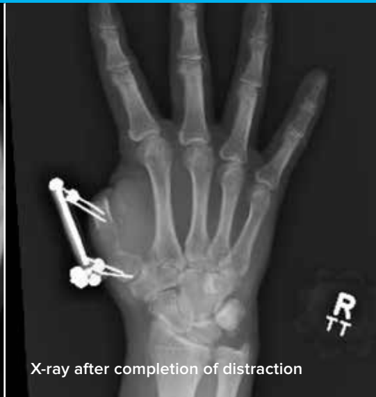
X-ray after completion of distraction