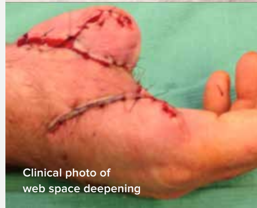
Clinical photo of web space deepening