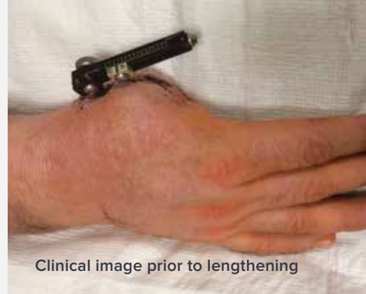
Clinical image prior to lengthening