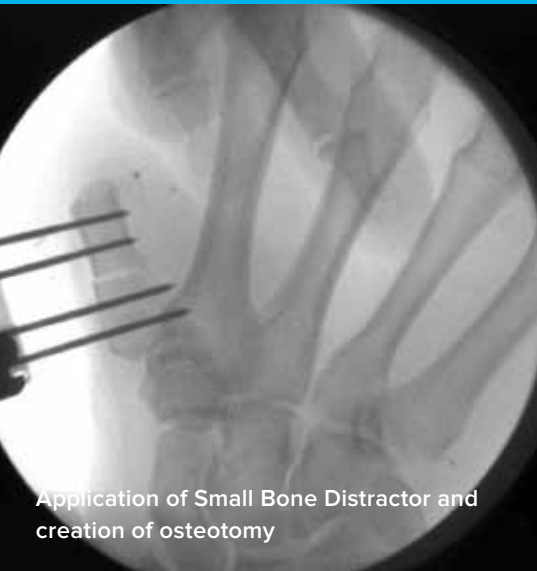
Application of Small Bone Distractor and creation of osteotomy