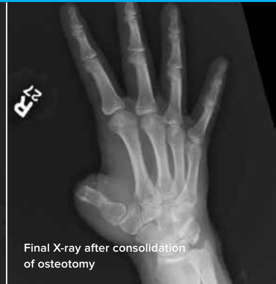
Final X-ray after consolidation of osteotomy