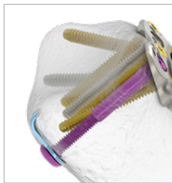
Dorsal (with Frag-Loc)